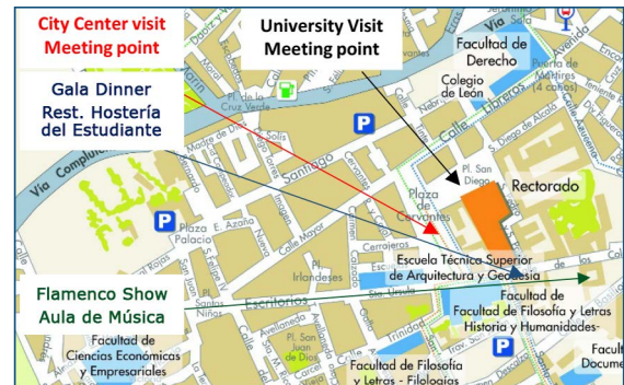
Alcalá de Henares, City Center